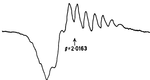
FIGURE 2. E.s.r. spectrum of sulphur containing 91.8% ^{33}\text{S} in 20% oleum. The solution contained ca. 0.2–0.3 mg S in 1 ml oleum.

confirms the presence of 4 equivalent sulphur atoms. To obtain the g value and the magnetic hyperfine coupling constant, allowing for the presence of more than one isotopic species, we have computer-simulated the observed spectra. Satisfactory agreement is found with g = 2.0163 , A_{\text{iso}} = 8.87 G and a half-linewidth at half height of about 4 G.§ The most abundant species ( ^{33}\text{S} ) 4 is responsible for the peaks observed. The next abundant species, ( ^{33}\text{S} ) 3 32 S, produces the slight inflections between the peaks. In Figure 2, \text{R}^2 appears as one broad resonance superimposed on the spectrum of \text{R}^1 . Since hyperfine splittings in \text{R}^2 are not resolved, we have not attempted to separate the signals from the two species.